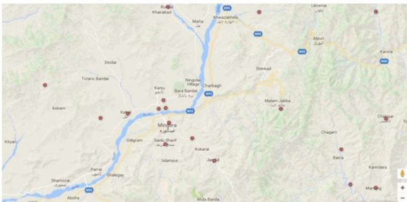
Figure 2 Some areas of field work 2